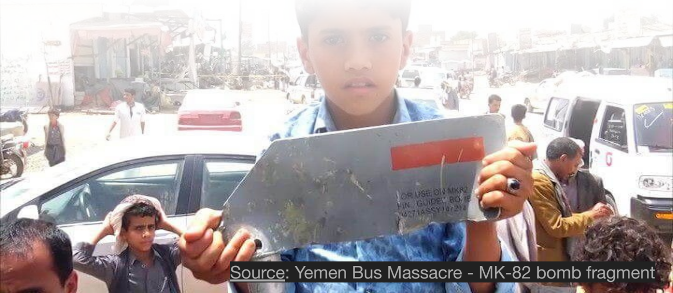
Source: Yemen Bus Massacre - MK-82 bomb fragment

Photo Description: U.S. supplied MK-82 bombs is the Yemen Bus Massacre which killed around 51 people, 40 being children [2].